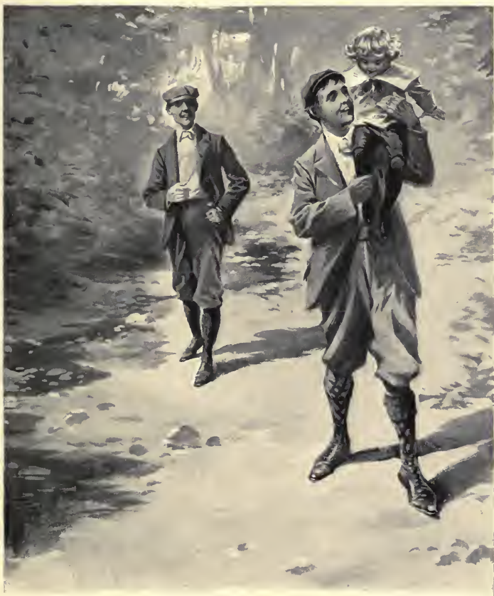
"FRED CROSSED THE BROOK AND CAUGHT HIM UP IN HIS ARMS."